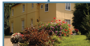
Jumped back on the Hopper to visit the Munnings Art Museum. Beautiful gardens, house and artist's studio with lovely cafe too.

Back on the Hopper with our all-day ticket.