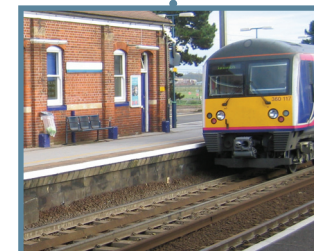
Manningtree Station for our train home.

Back on the Hopper with our all-day ticket.