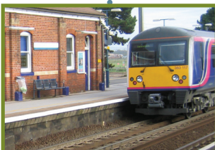
Arrived by train at Manningtree, jumped on the Hopper bus.