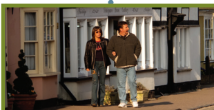
Tea room lunch in Dedham followed by a Church tower tour and a walk around the village and shops. Simply stunning!

Caught the 'Trusty' electric boat to Dedham while the others walked along the riverside path.